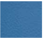
Light Blue VM 21