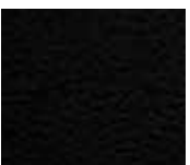
Black VM 90