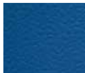
Dark Blue** VM 18