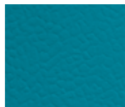
Ocean Blue VM 23