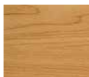
Maple ** VM 66